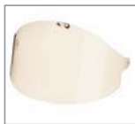
Replacement visor Anti-scratch (AS/AS) coating on both sides R 56 555