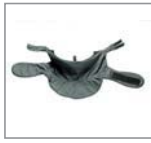
Nomex/Belgian type Three-layer, high-quality Nomex/Aramide fabric, antistatic, resistant to many acids, alkalis and alkaline solutions R 56 621