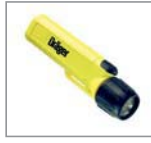
Lamp UK 4AA-ES1 Helmet lamp with highest EX protection class R 56 109