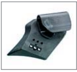
Lamp holder S-Fix Of high-temperature-resistant black plastic R 56 700