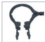
Adapter ring for Savox coms R 56 828