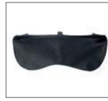
Nomex Short and tight fitting, Nomex impregnated with fluorocarbon R 56 620