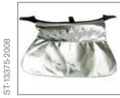
Nomex/Aluminium Aluminized with reverse side of Nomex III R 56 622

Dräger lamps are exceptionally bright, particularly light in weight, and robust.