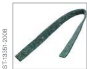
Additional pad For head sizes 50 to 51 R 56 072

Additional accessories provide even greater protection to the wearer.