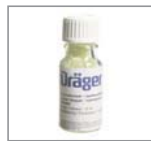
Paint repair kits (For color selection, please refer to the front plates)