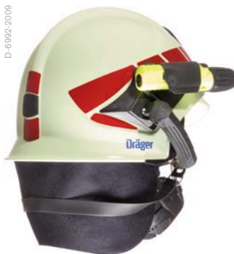
Dräger HPS 6200 with S-Fix-adapter