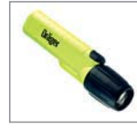
Lamp UK 4 LED High-power lamp with new LED technology R 56 724