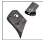
Lamp holder Q-Fix Made of high-temperature-resistant black plastic R 56 950