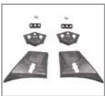
Mask adapter retrofit kit Q-Fix Fixing to position points on the helmet instead of the mounted plate for S-Fix R 56 824