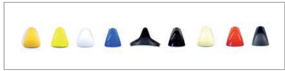
R 56- -012 -020 -011 -013 -044 -017 -018 -014 -029