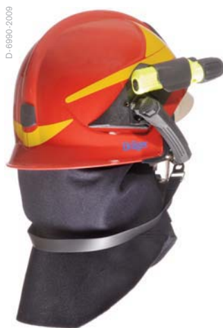
Dräger HPS 6200 with Q-Fix-adapter