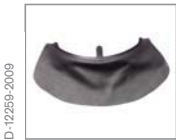
Leather Protection against embers, ashes etc. R 57 405