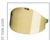
Replacement (anti-scratch) visor Gold-coated visor of 2 mm polysulfone R 57 409