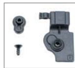
Adapter for communication system Right R 56 825 Left R 56 826