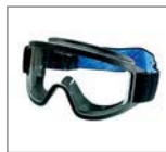
Safety goggles Black, visor of polycarbonate (2 mm), anti-scratch and anti-fog coating, optical class 2 and ballistic protection class B R 56 076