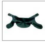
Wool Long (Dutch type), 100% wool, oil- and water-repellant, flame-retardant, edged at bottom with Nomex III R 56 623