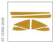
Reflective strips (special design) Style Wing 1 Lemon-yellow R 56 198 Ruby-red R 56 199

The front plates are available in different colors and equipped with extra rubber rings.