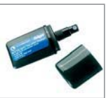
Anti-fog agent For all visors R 56 542