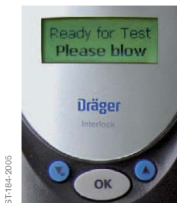
2. Receive request to blow into Dräger Interlock XT