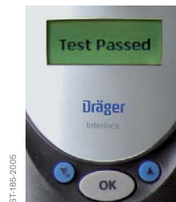
4. Accepted breath sample: motor starter is enabled