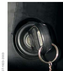
1. Turn ignition on