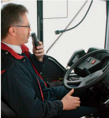
Dräger Interlock XT Use in a bus