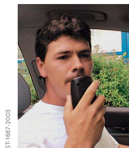
3. Measurement of breath alcohol concentration takes place