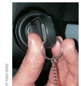
5. Start motor