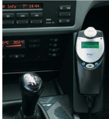
Dräger Interlock XT Fits in the dashboard