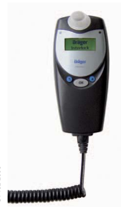
Dräger Interlock XT A safe start

The use of auxiliary means to circumvent the Dräger Interlock XT, as for example an air pump or the use of filters, is reliably detected and starting the motor is prevented. A vehicle start-up as by push-start without previous delivery of an accepted breath sample is recorded in the data log.