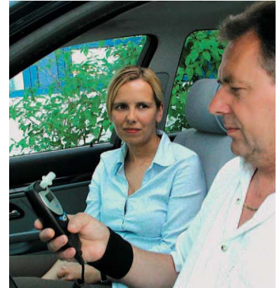
Dräger Interlock XT Use in private car