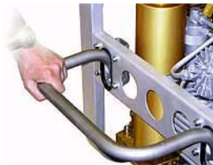
Ergonomic swing-out handles