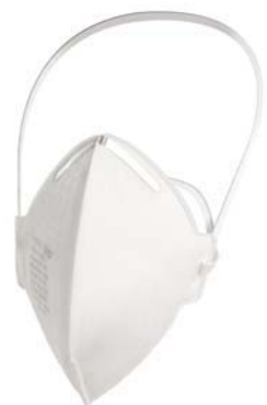
Dräger X-plore® 1750 N95

The specially developed CoolSAFE™ filter material combines various high-performance filter media to achieve an excellent filter performance. Coarse and fine particles are effectively stopped in the various filter layers. At the same time, the breathing resistance remains very low, allowing the user to work easily and without tiring for longer periods.