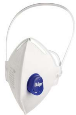
Dräger X-plore® 1700